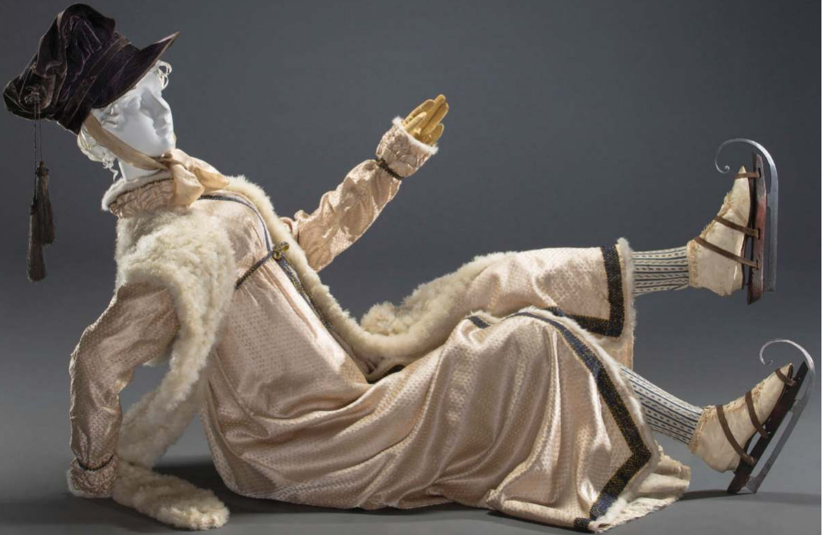
Ice skating ensemble, 1810s, Photo: Brian Davis, © FIDM Museum, Courtesy American Federation of Arts.

Sporting Fashion and FIDM Museum Curator