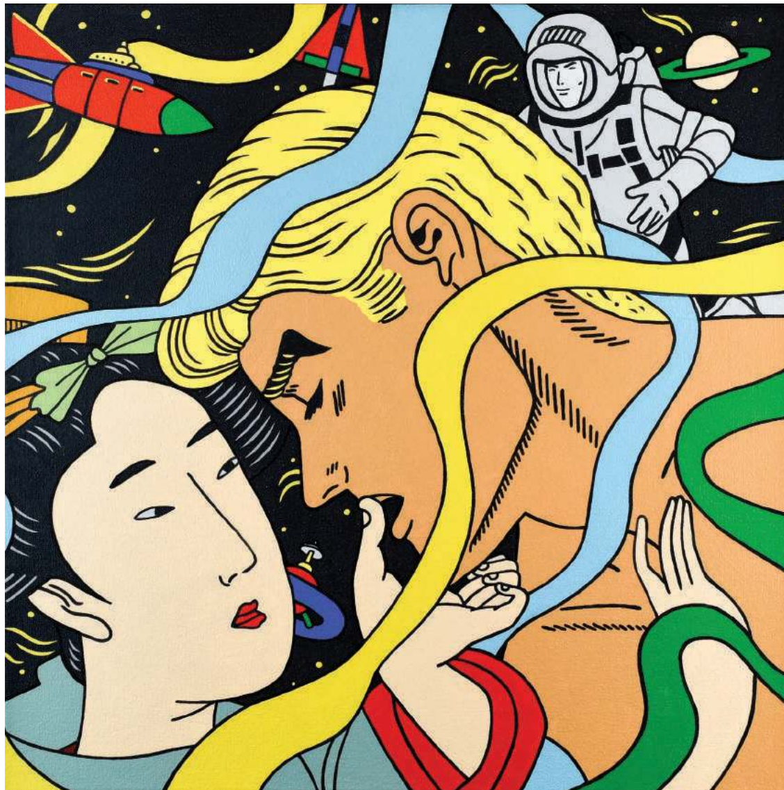
Roger Shimomura, American born 1939, Great American Muse #37 , 2015, Acrylic on canvas, 24 x 24 inches, Friends of Art Acquisition Fund, 2022.23, © Roger Shimomura

Roger Shimomura, Great American Muse #37