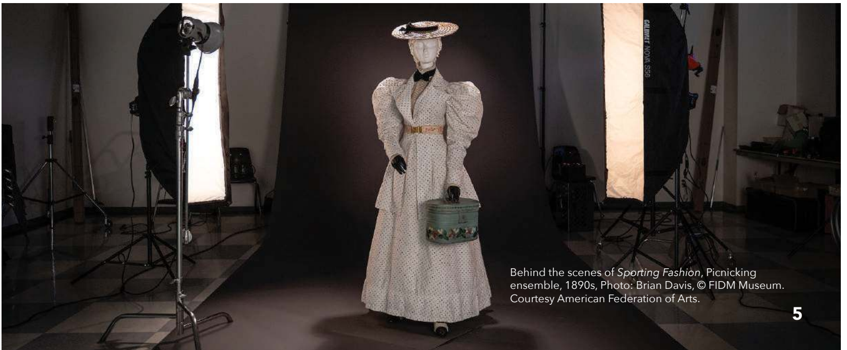
Behind the scenes of Sporting Fashion , Picnicking ensemble, 1890s, Photo: Brian Davis, © FIDM Museum, Courtesy American Federation of Arts.