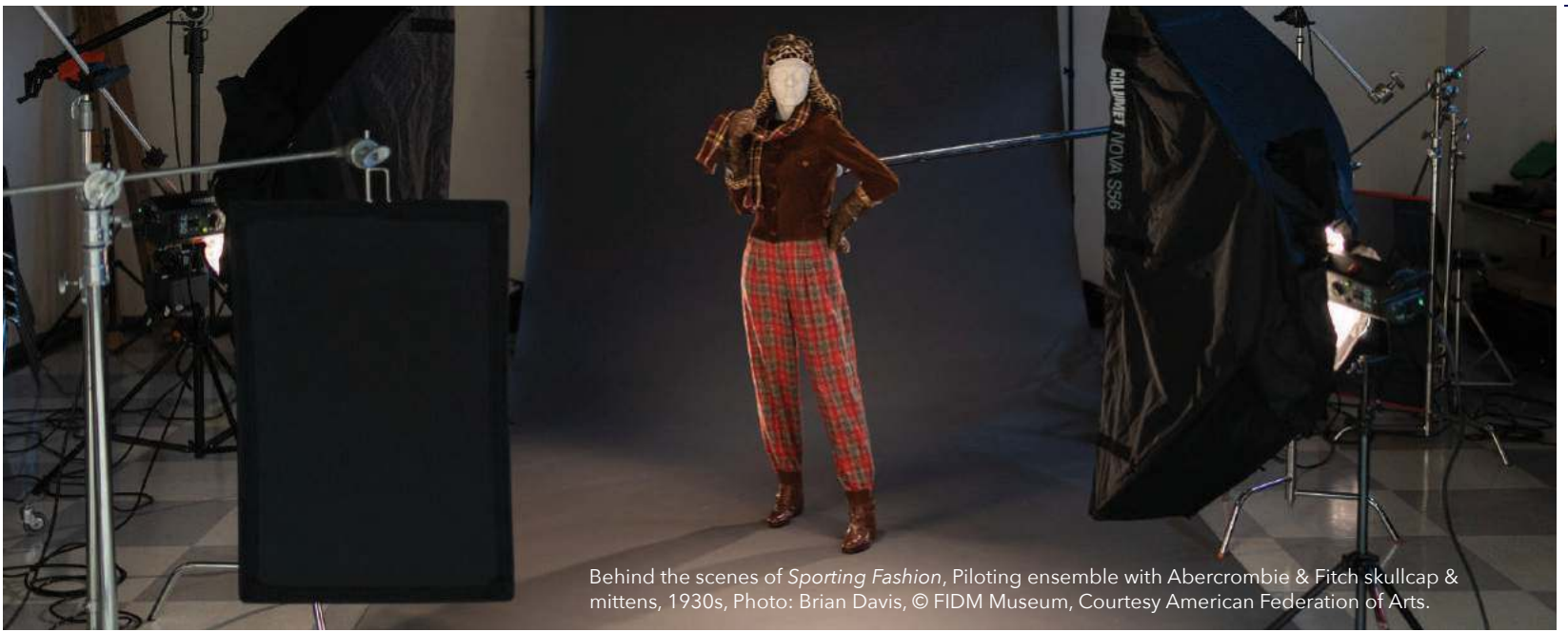
Behind the scenes of Sporting Fashion , Piloting ensemble with Abercrombie & Fitch skullcap & mittens, 1930s, Photo: Brian Davis, © FIDM Museum, Courtesy American Federation of Arts.