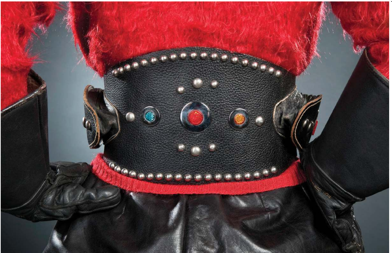
Cover Image: Motorcycling ensemble, 1930s, Photo: Brian Sanderson, © FIDM Museum, Courtesy American Federation of Arts. Above: Motorcycling belt (back), 1930s, Photo: Brian Sanderson, © FIDM Museum, Courtesy American Federation of Arts.