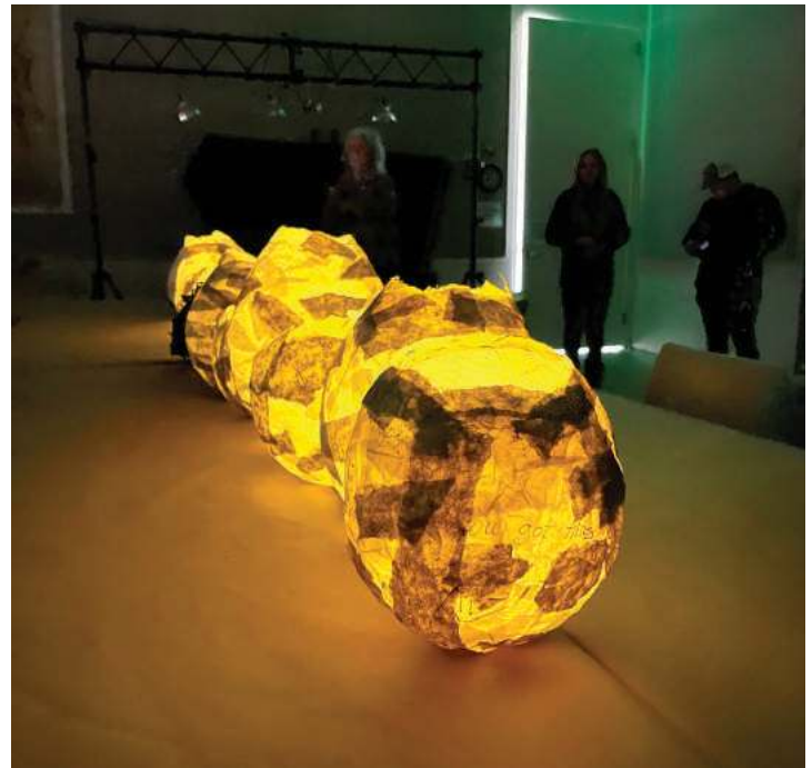
Workshop view from Heavy Hearts, Grateful Souls a workshop led by Dana Keeton and Zaiga Minka Thorson