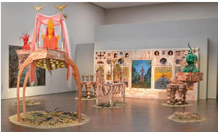
Installation view of Edouard Duval-Carrié: Endless Flight , 2017, at the Figge Art Museum